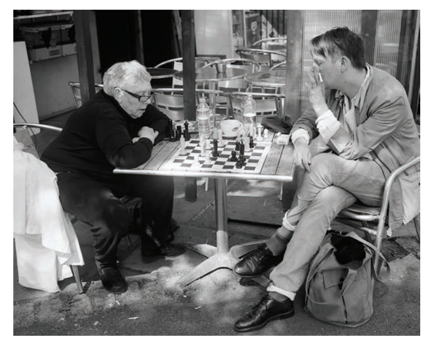
Figure 1: A lesson in strategy – Michèle Bernstein, London 2013, playing chess with Everyone Agrees, English editors of The Night, photo courtesy of Everyone Agrees and Book Works.

In a photograph accompanying an interview with Bernstein published on the occasion of the first translation of The Night into English in 2013 (Figure 1) the author, now in her early 80s (Bernstein was born in 1932), challenges her English editor to a game of chess. It is an artfully staged image that not only encapsulates the themes of play and strategy embodied in Bernstein's novels but